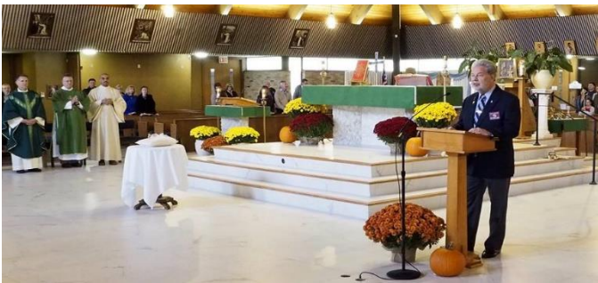
Silver Rose Transfer at St. Mary's

October 28 th at St. Mary's Church in Coventry, CT.