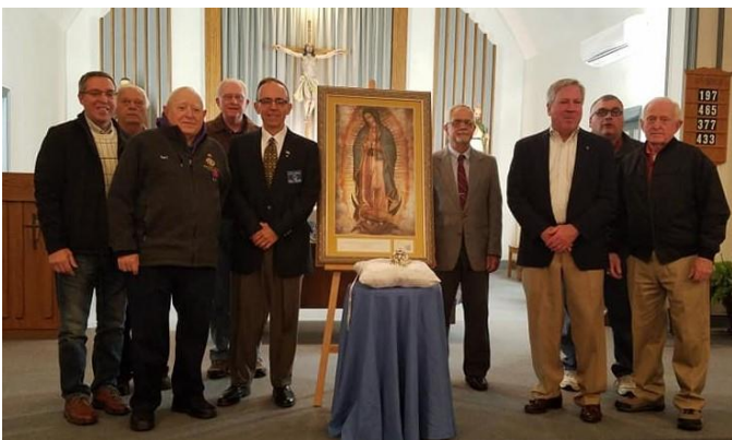
Last Silver Rose in RI for this Fraternal Year

The last event in RI was held @ St. Vincent DePaul (Blessing Council) in Coventry.